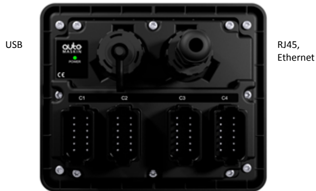
C1 Power C2 All Faults C3 C4